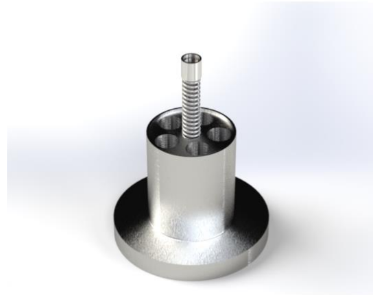
Figure 2: Photo of Valve Assembly